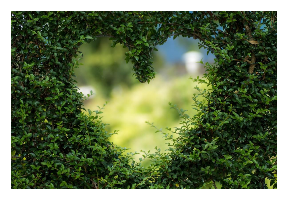
The right someone is out there, and they are looking for me as much as I'm looking for them, and every day we come closer to one another. We will find each other, and soon.

Use an affirmation – An affirmation is a simple sentence, phrased in the positive. An affirmation is a focusing tool – it keeps your eyes on the prize. It also acts as a way to banish doubt and get you out of the habit of dwelling on being alone (and/or the lack of eligible bachelors.)